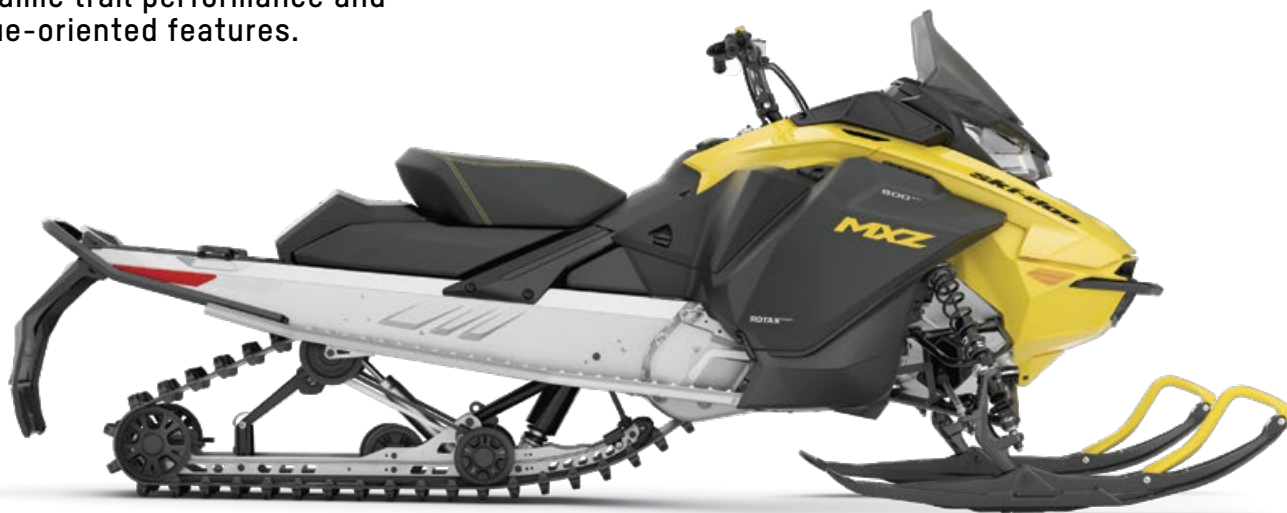
MXZ SPORT 600 EFI SHOWN

Dynamic trail performance and value-oriented features.